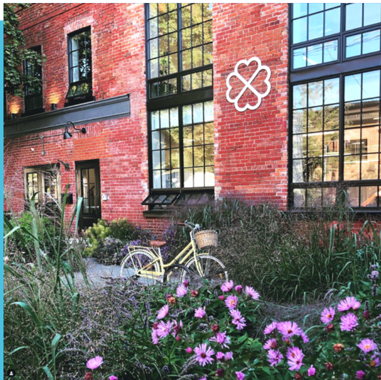
High Park Clendenan Campus